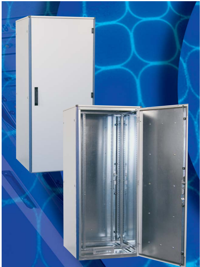
Attenuation 19" cabinet

Average value of all 4 sides · Gauging acc. To EN 50147-1 et al.